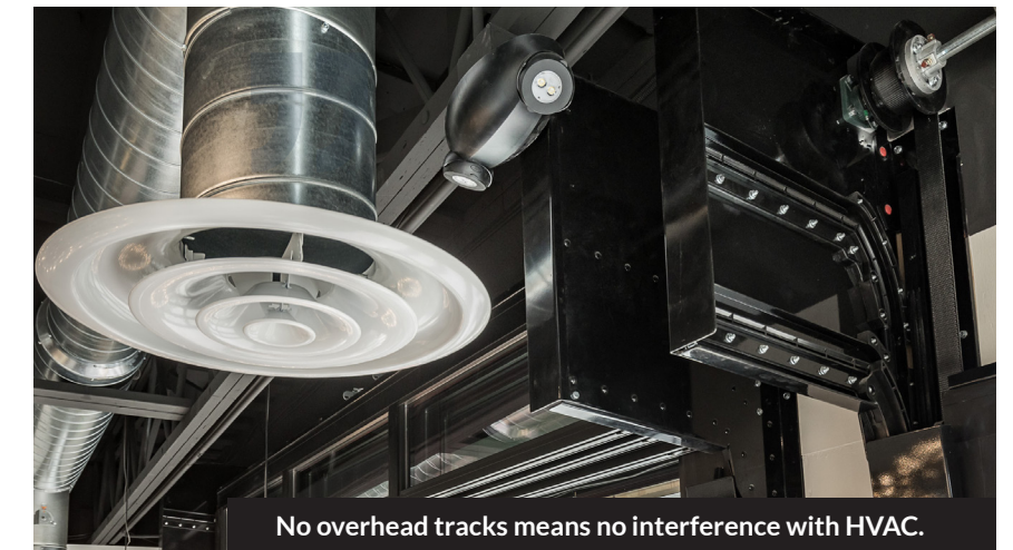
No overhead tracks means no interference with HVAC.

Customers at Bangkok Thai restaurant often praise the expansive windows that provide stunning views of the mountains and nearby Liberty Lake. The VertiStack Clear doors add to the overall dining experience, making the restaurant a favorite. By allowing ample daylight and offering breathtaking vistas, these unique doors perfectly complement the space. ■