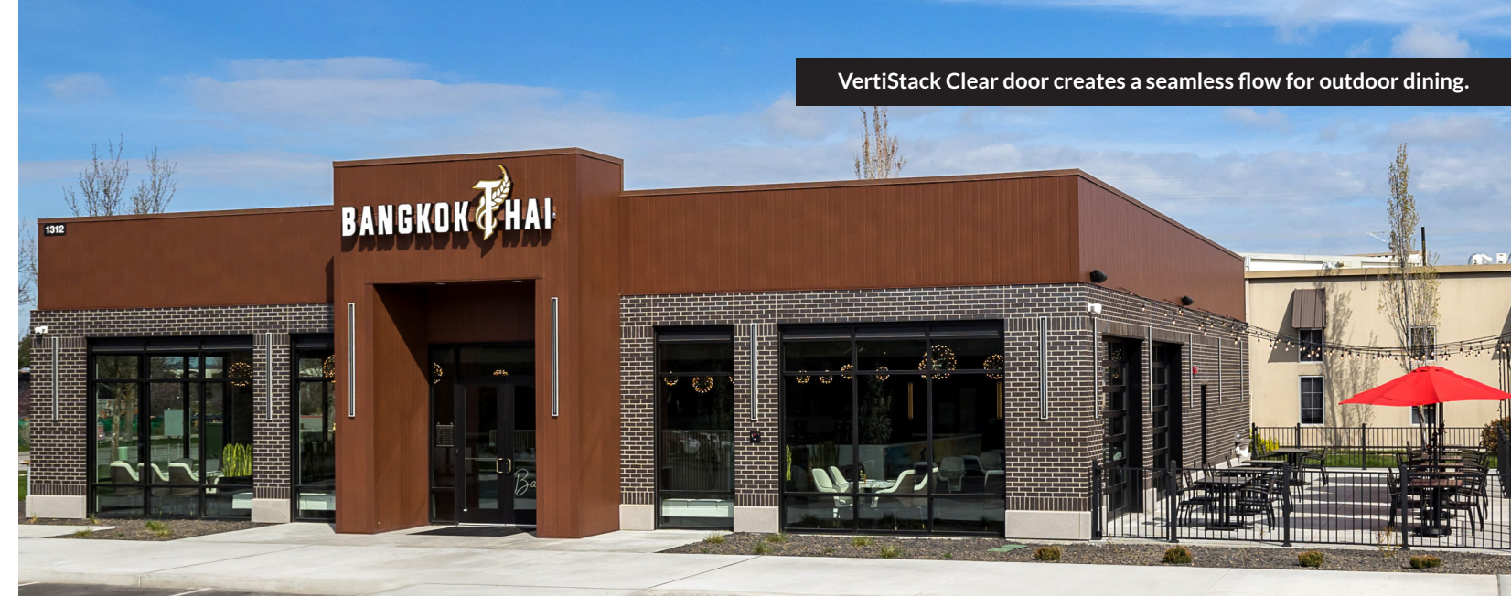
VertiStack Clear door creates a seamless flow for outdoor dining.