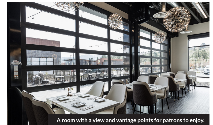
A room with a view and vantage points for patrons to enjoy.

Visit clopaydoor.com to learn more about Clopay Commercial Door Products.