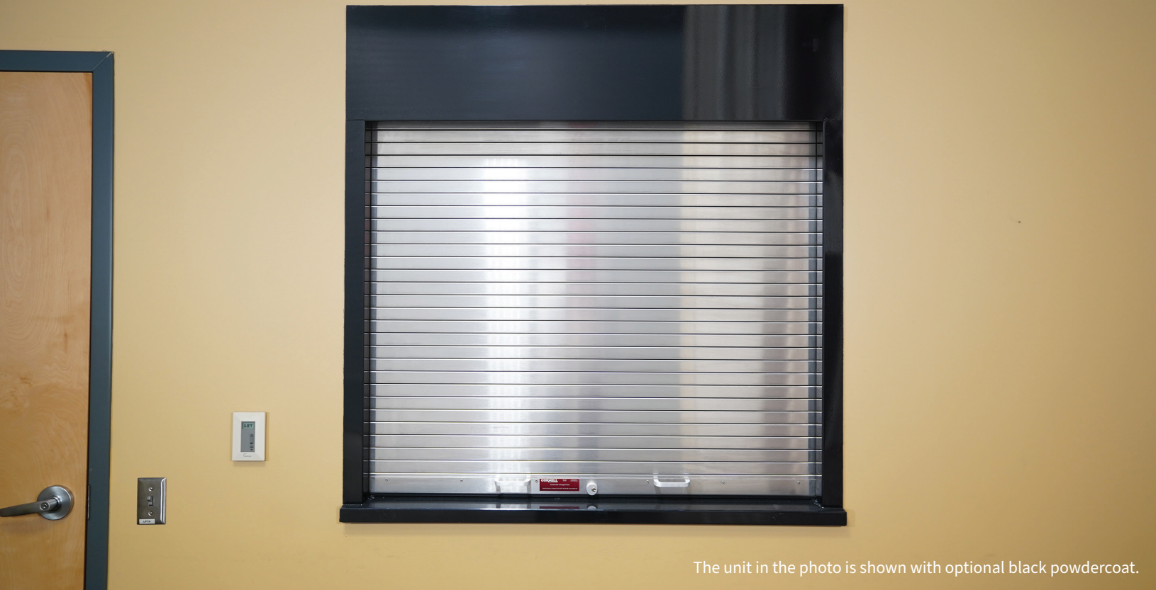
The unit in the photo is shown with optional black powdercoat.

Model ESC20 with frame and integrated sill