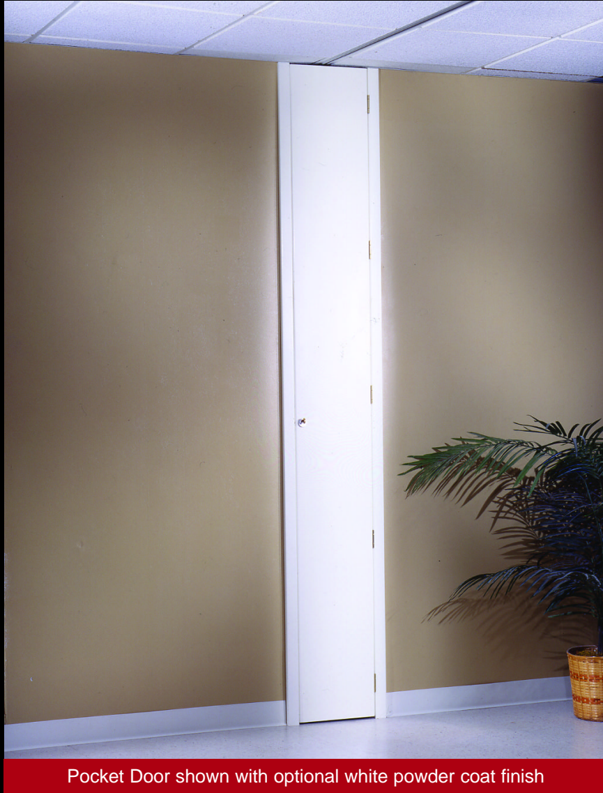
Pocket Door shown with optional white powder coat finish

Cornell offers a door and frame to neatly finish Side Folding Grille pocket openings. Both the door and frame are powder coated gray as standard. Many additional color options are available.