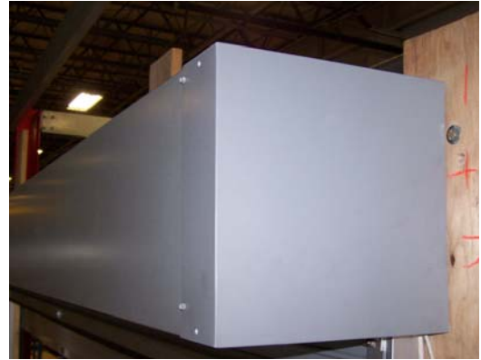
Mechanism Cover – Side View